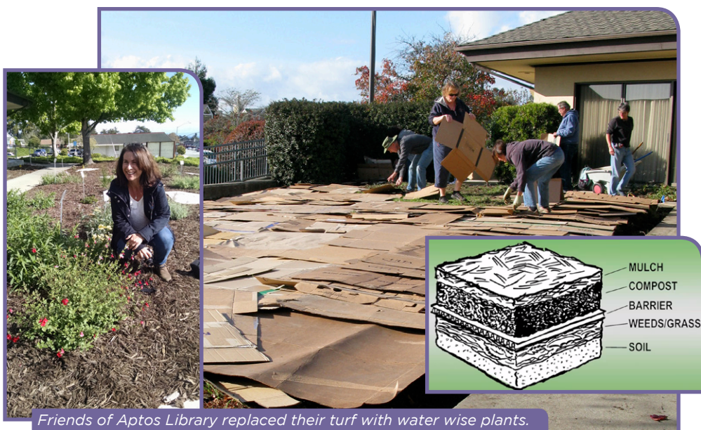
Friends of Aptos Library replaced their turf with water wise plants.

https://green-gardener.org/lose-your-lawn-with-sheet-mulching/